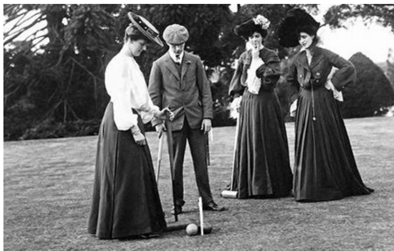
A tense moment during the inaugural RTWCC Family Tournament back in 1905